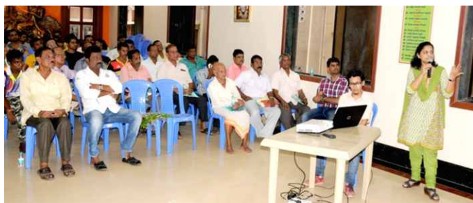
Demand driven programmes at vilages