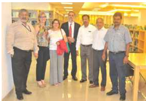
Spanish team from University of Las Palmas de Gran Canaria (ULPGC) in the Library.