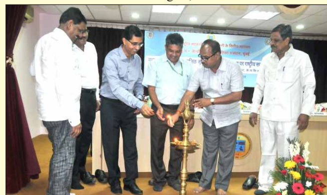
National Conference on Social Security and Skill Development for Fisherwomen 19-20, August, 2015.