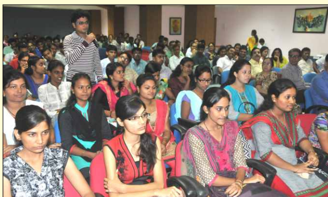
Orientation Programme for M.F.Sc. (2015-17) Students