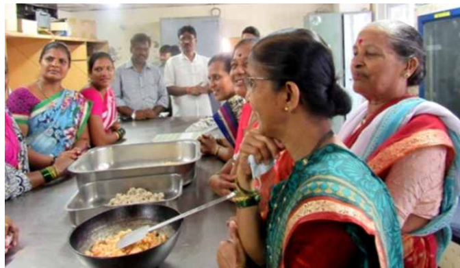
Demonstration of value added fish products to fisherwomen,