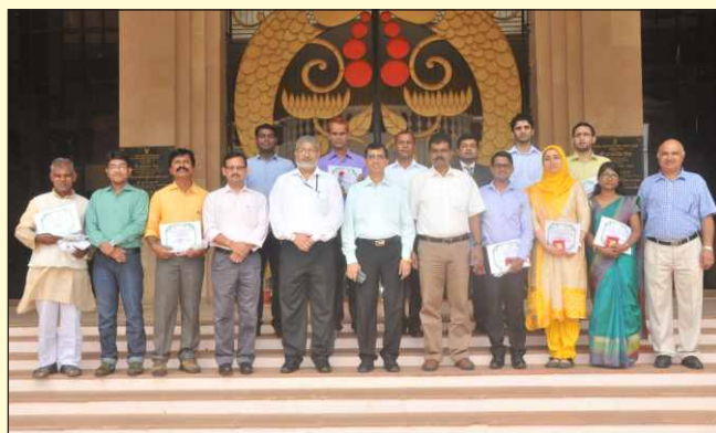
CIFE Faculty with Endowment Awardees 31 August, 2015