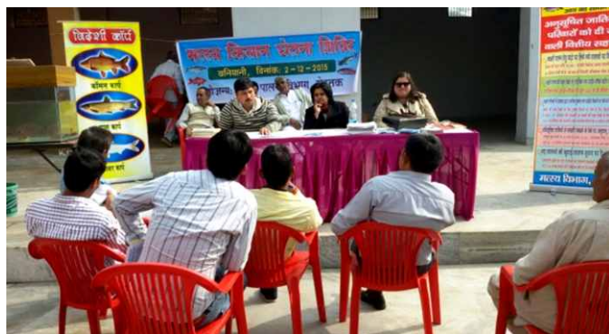
Attracting and Retaining Rural Youth to Agriculture (ARYA) towards fisheries.