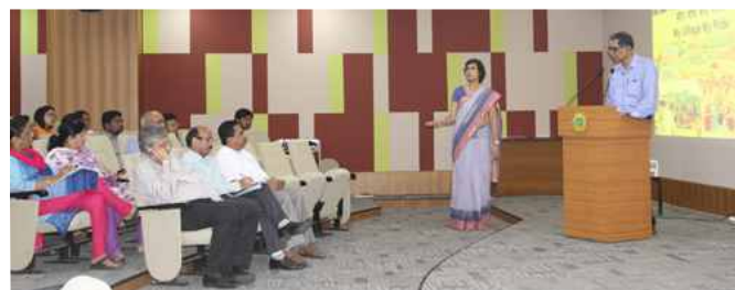
Launching Mera Gaun Mera Gaurav

The major activities conducted during this period (Oct-Dec, 2015) were; Attracting Fisher-Youths in Fisheries Education, Training Need Assessment, Demonstration of value added fish products to fisherwomen, and Developing Soil and Water Health Card for Aquaculture. Many other activities were also initiated which are in initial stage.