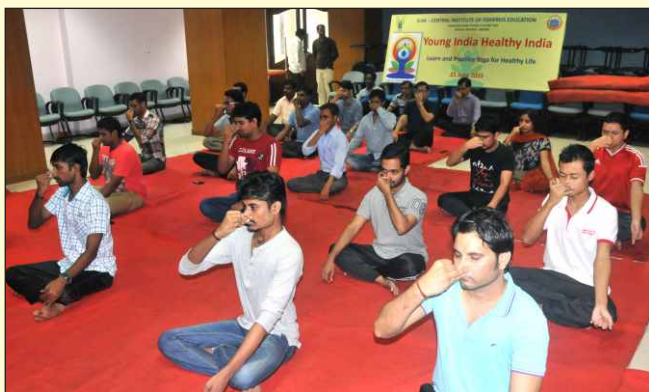
Yoga Day - 21st June 2015