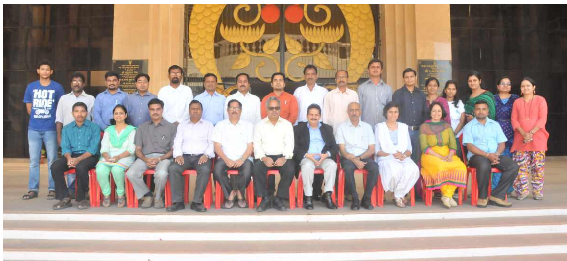
Molecular, Nanotechnological and Immunological Diagnostics in Fisheries and Aquaculture, 25 February - 17 March, 2015 (12 participants)