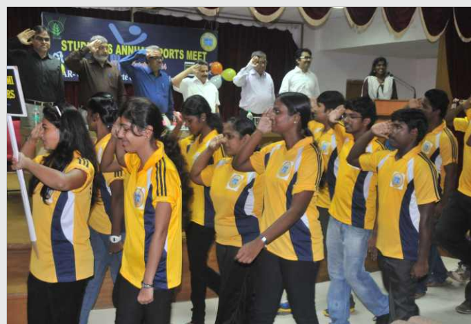
Celebrated Students' Sports Meet during 17-19 th October 2014