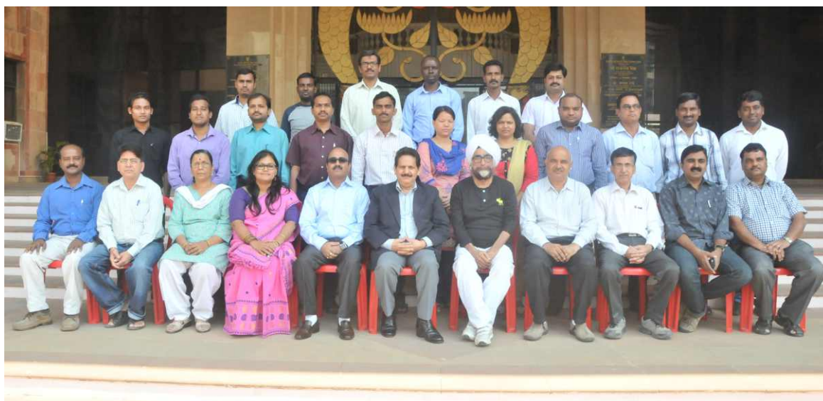
Utilization of Degraded Water Resources through Pisciculture, 28 January-17 February, 2015 (19 participants)