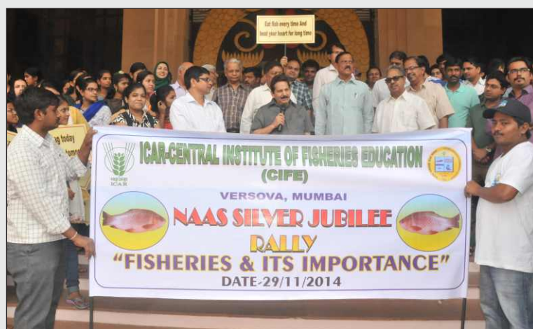
NAAS Silver Jubilee Rally on 29 th November 2014