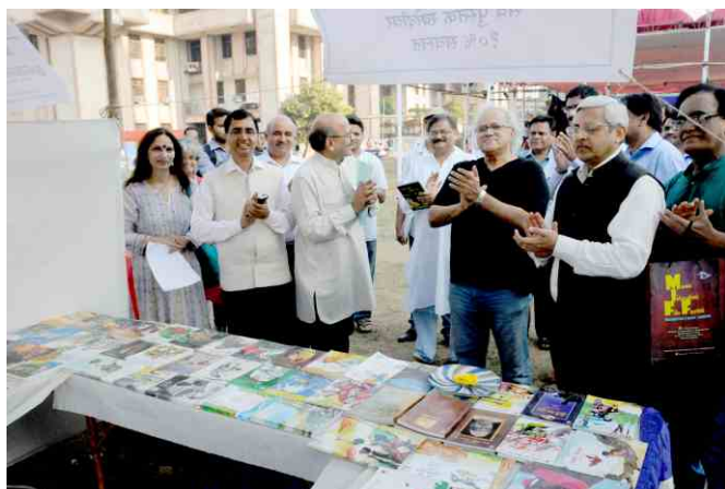
Hindi Book Fair January 2016