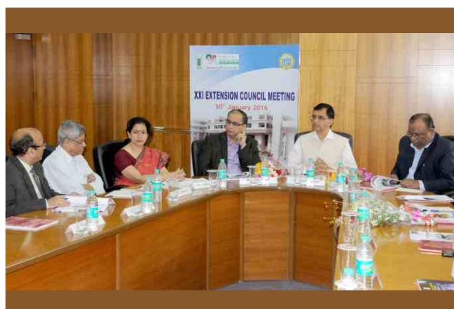
XXI Extension Council Meeting 30 January, 2016