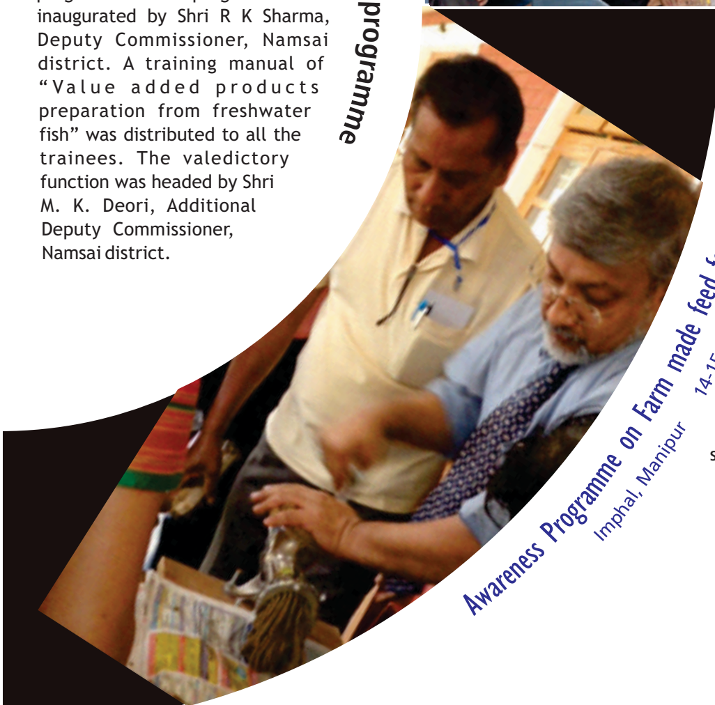
Awareness Programme on Farm made feed for aquaculture Imphal, Manipur 14-15 Mar, 2016

The aim of this hands-on-training was raise awareness to their diverse stakeholder about the importance of feed based aquaculture in fisheries sector.