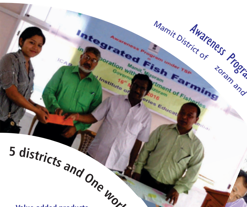
Awareness Programme under TSP on Integrated Fish Farming Mamit District of Mizoram and Kolasib District of Mizoram 16-17 March, 2016

Pig-cum fish culture is very prominent in Mizoram state, however, the tribal farmers need to be supported for upliftment for their better livelihood. In this context the financial support from ICAR-CIFE, as Pigstys and Piglets, to the six tribal farmers of the Kolasib District of Mizoram was highly appreciated by Joint Director Manipur Fisheries