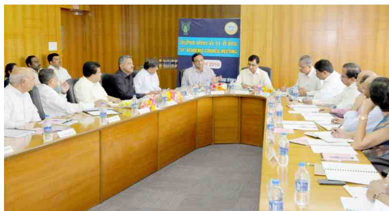
Academic Council Meeting 15 March, 2016