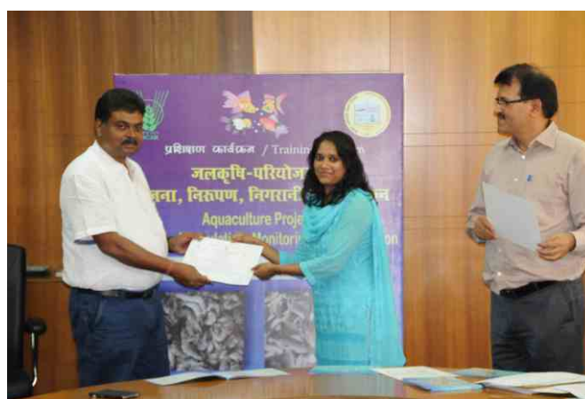
Training programme on Aquaculture Project Formulation & Management Government of Telangana April 2016