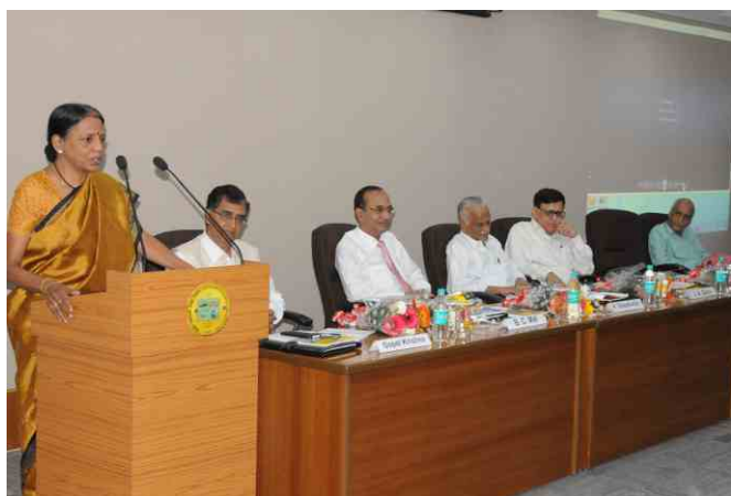
Research Advisory Council Meeting 26-27 February, 2016