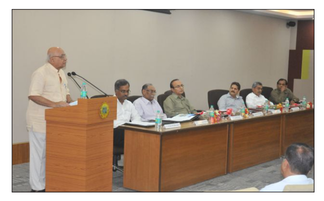
QRT Meeting - 20 May 2014