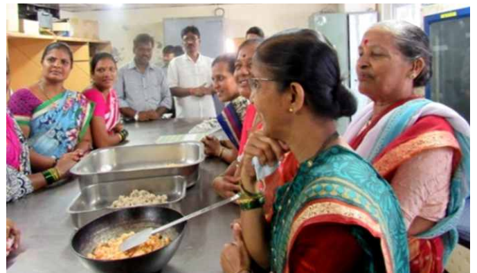
Demonstration of value added fish products to fisherwomen,