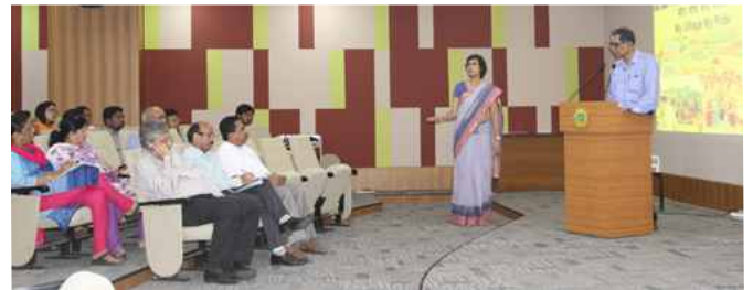
Launching Mera Gaon Mera Gaurav

The major activities conducted during this period (Oct-Dec, 2015) were; Attracting Fisher-Youths in Fisheries Education, Training Need Assessment, Demonstration of value added fish products to fisherwomen, and Developing Soil and Water Health Card for Aquaculture. Many other activities were also initiated which are in initial stage.