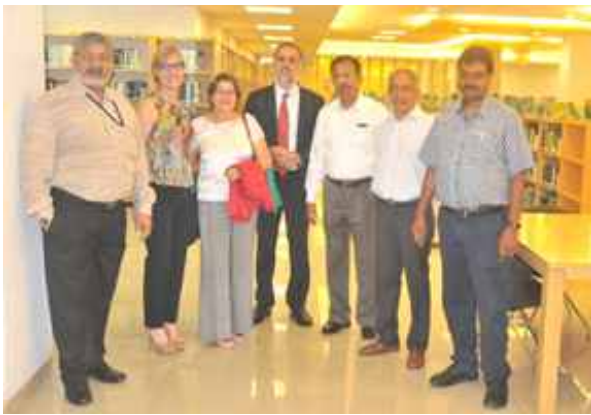
Spanish team from University of Las Palmas de Gran Canaria(ULPGC) in the Library.