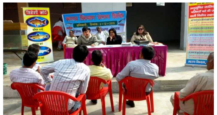
Attracting and Retaining Rural Youth to Agriculture (ARYA) towards fisheries.