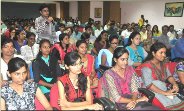
Orientation Programme for M.F.Sc. (2015-17) Students