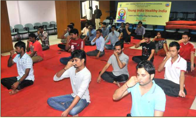
Yoga Day - 21st June 2015