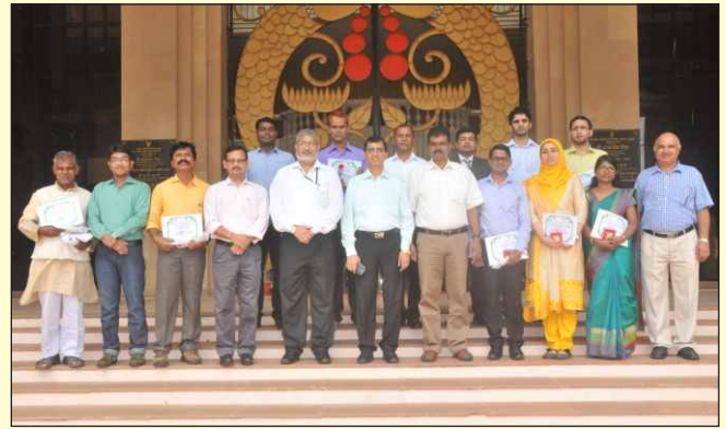
CIFE Faculty with Endowment Awardees 31 August, 2015