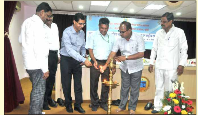
National Conference on Social Security and Skill Development for Fisherwomen 19-20, August, 2015.