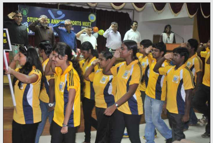
Celebrated Students' Sports Meet during 17-19 th October 2014