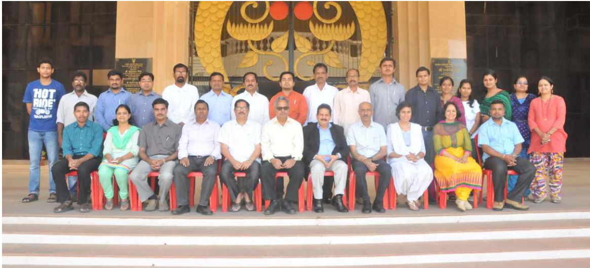
Molecular, Nanotechnological and Immunological Diagnostics in Fisheries and Aquaculture, 25 February - 17 March, 2015 (12 participants)