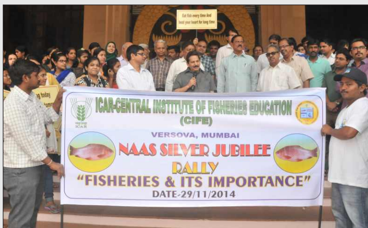
NAAS Silver Jubilee Rally on 29 th November 2014