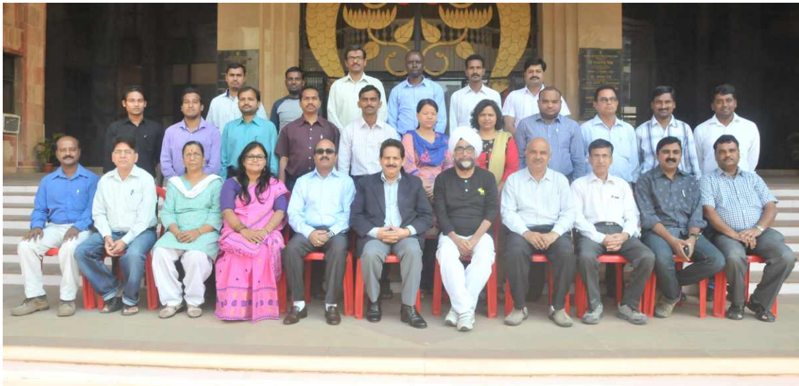
Utilization of Degraded Water Resources through Pisciculture, 28 January-17 February, 2015 (19 participants)