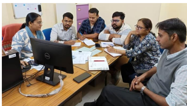
Second Session on 9.1.2025