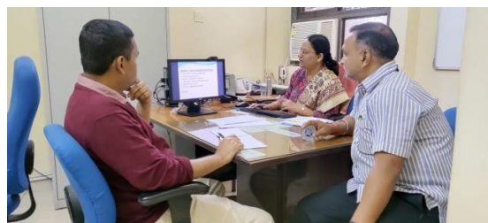
Second Session on 23.12.2024