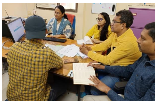
First Session on 9.1.2025