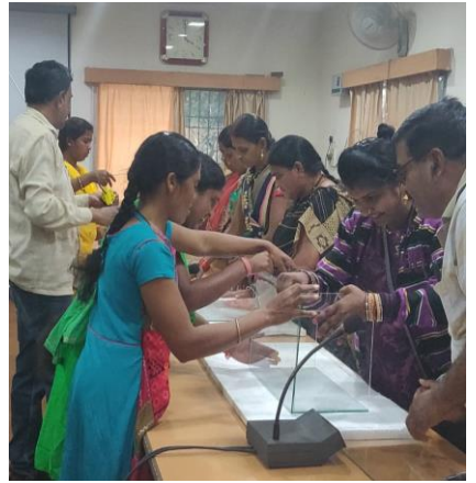
Practical session on fabrication of Aquarium