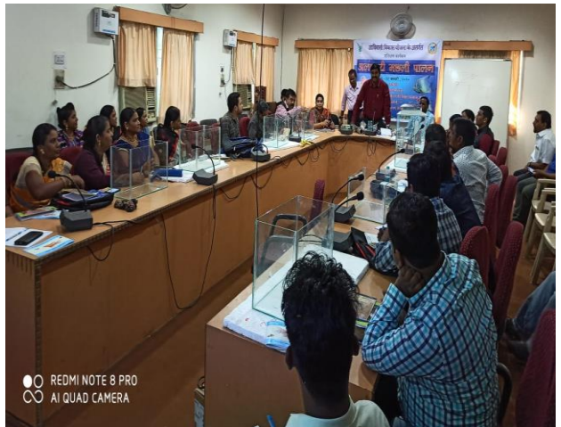
Practical session on Aquarium Set up