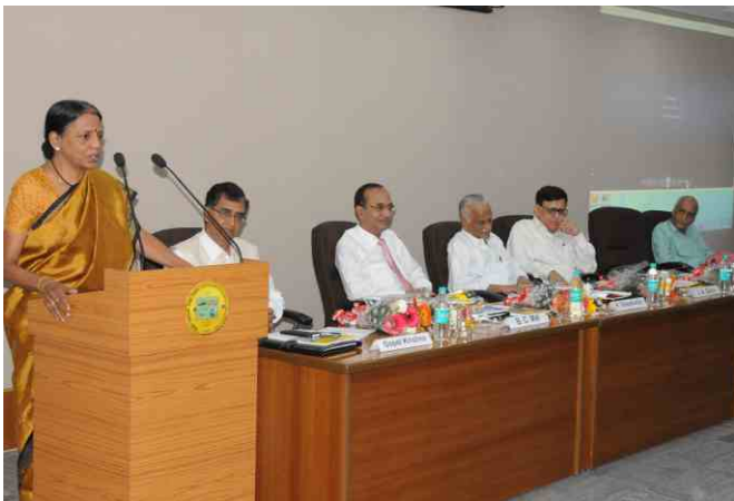
Research Advisory Council Meeting 26-27 February, 2016