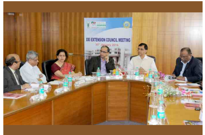
XXI Extension Council Meeting 30 January, 2016