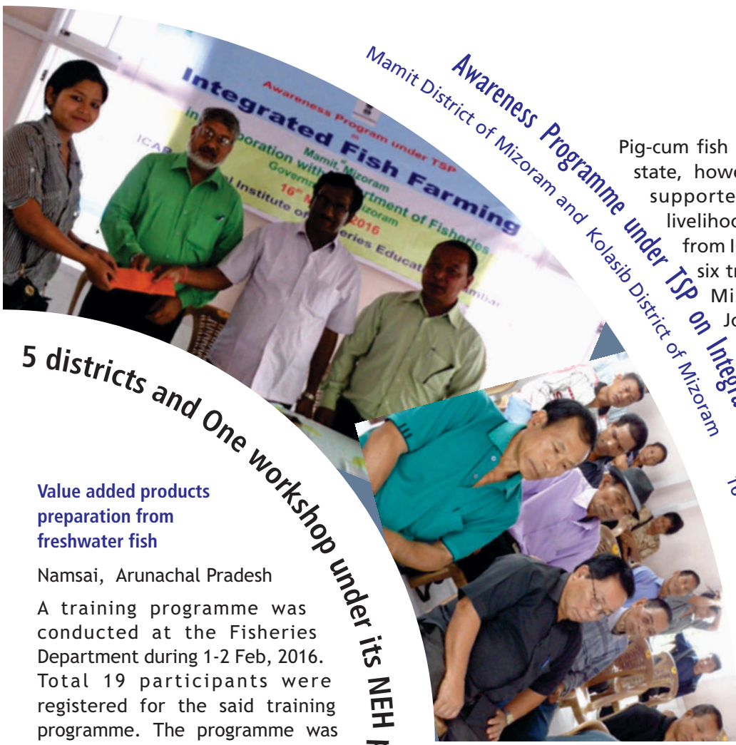
Awareness Programme under TSP on Integrated Fish Farming Mamit District of Mizoram and Kolasib District of Mizoram 16-17 March, 2016

Pig-cum fish culture is very prominent in Mizoram state, however, the tribal farmers need to be supported for upliftment for their better livelihood. In this context the financial support from ICAR-CIFE, as Pigstys and Piglets, to the six tribal farmers of the Kolasib District of Mizoram was highly appreciated by Joint Director Manipur Fisheries