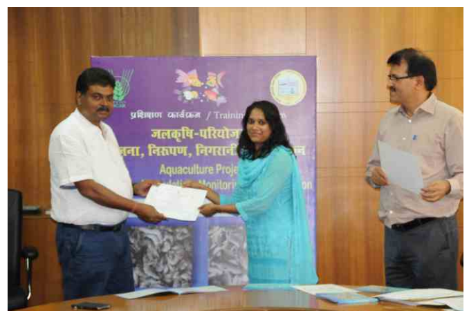
Training programme on Aquaculture Project Formulation & Management Government of Telangana April 2016