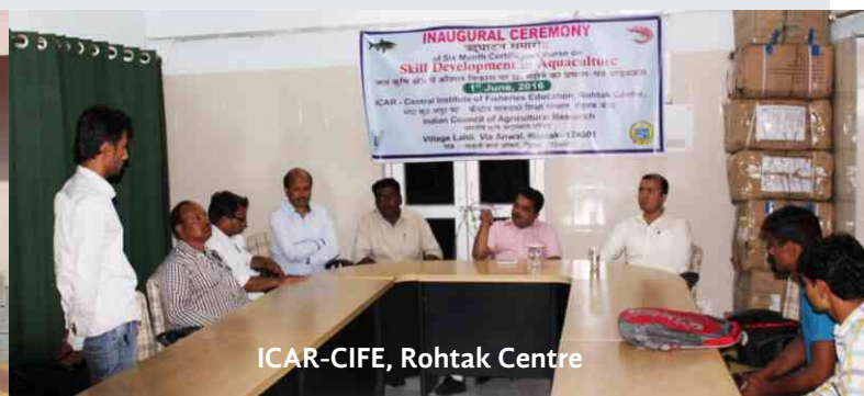
ICAR-CIFE, Rohtak Centre