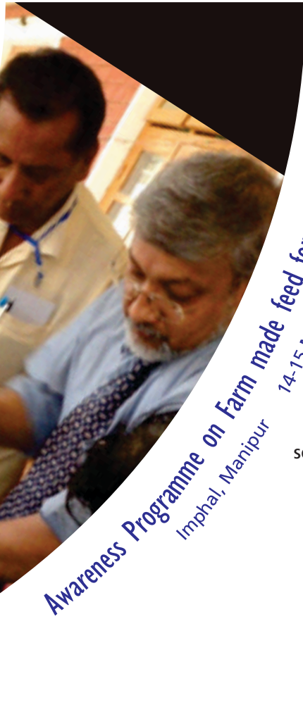
Awareness Programme on Farm made feed for aquaculture Imphal, Manipur 14-15 Mar, 2016

Namsai, Arunachal Pradesh A training programme was conducted at the Fisheries Department during 1-2 Feb, 2016. Total 19 participants were registered for the said training programme. The programme was inaugurated by Shri R K Sharma, Deputy Commissioner, Namsai district. A training manual of "Value added products preparation from freshwater fish" was distributed to all the trainees. The valedictory function was headed by Shri M. K. Deori, Additional Deputy Commissioner, Namsai district.