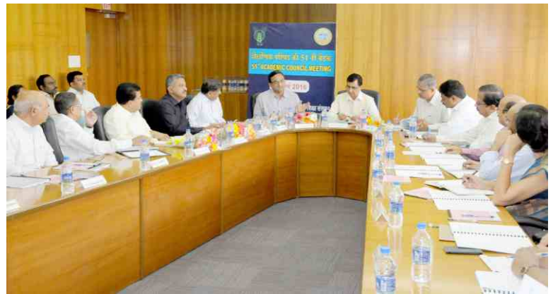
Academic Council Meeting 15 March, 2016