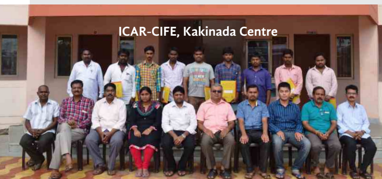
ICAR-CIFE, Kakinada Centre