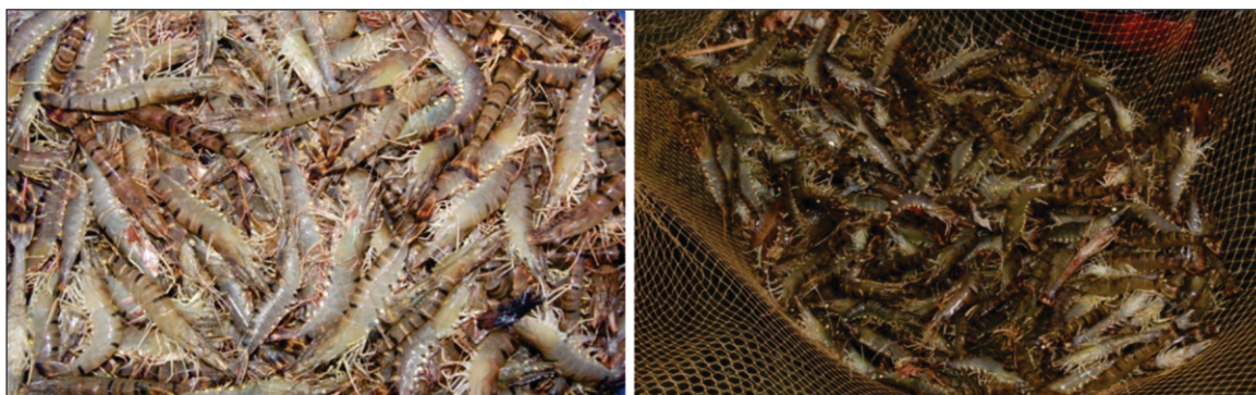
Haul of tiger shrimp at the Rohtak centre of CIFE

The grow-out culture experiments of tiger shrimp ( Penaeus monodon ) using inland-saline water have been carried out at CIFE Rohtak Centre with an objective to produce two crops in one year. The first crop had been successfully harvested by the last week of June and a total production of 1680 kg/ha in 96-days with a net survival of 82% was obtained at a stocking density of ten numbers per square metre. The production obtained was at par with the production obtained in the commercial culture of coastal areas at the same stocking density. The second crop was harvested by the second week of November, 2010 and a total production of 650 kg/ha was obtained with a net survival of 60% in 90 days of culture