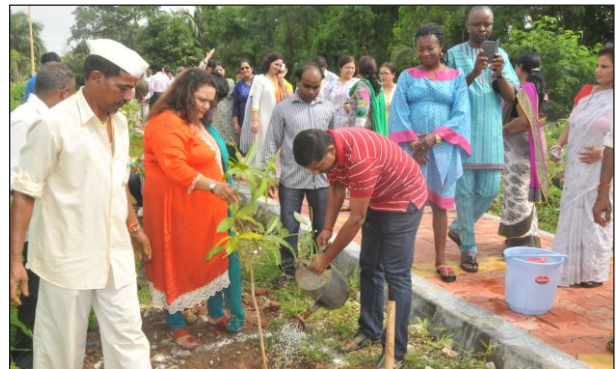
Plantation on Independence day - 15 August 2014