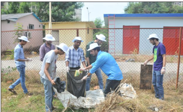
Swatcha Bharat _ 28 September 2014