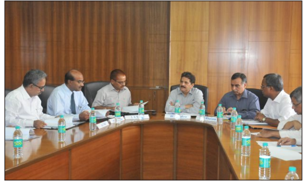
Academic council Meeting - 15 May 2014