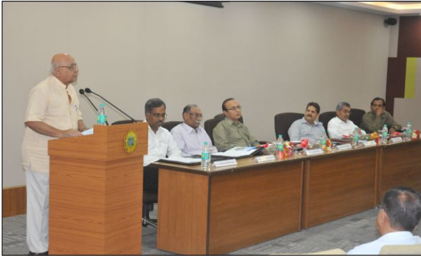
QRT Meeting - 20 May 2014