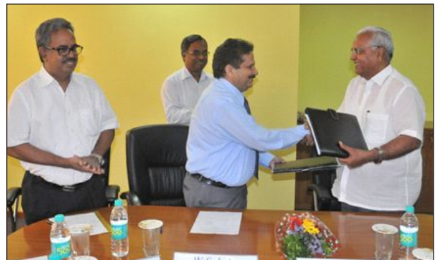
CIFE signs MoU with CAU, Imphal 14 June 2014