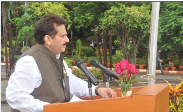
Independence day Celebrations- 15 August 2014